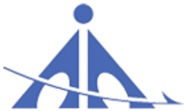
(Airports Authority of India)

Our clients are our credentials. To name a few